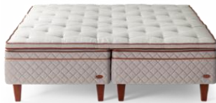
DUX classic frame bed with natural latex top pad.

Many DUX customers have had their bed forever, long after our warranty or normal usage, without care. We believe the ability to to change parts, renew or restore our products, helps that long-lasting effect, unlike any other product. We guide the customer on caring for their bed so that even after the 20-year warranty is over, no problems.